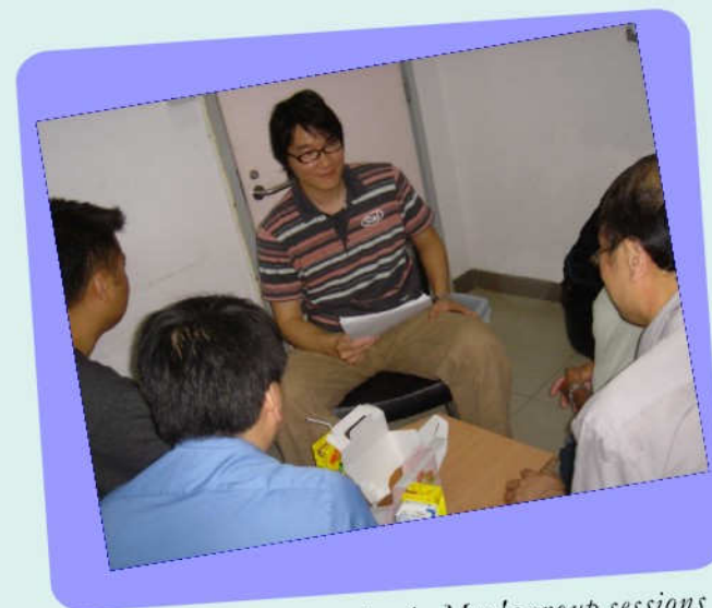
Batterers participating in Men's group sessions